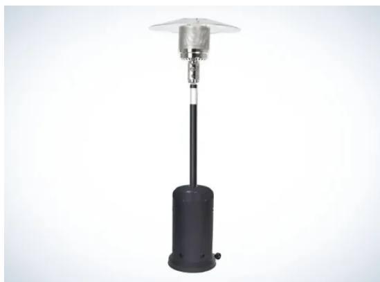
AmazonBasics 46,000 BTU Outdoor Propane Patio Heater with Wheels